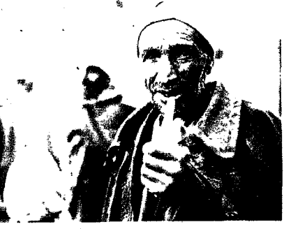
Right, a student at the Tehran School of Social Work