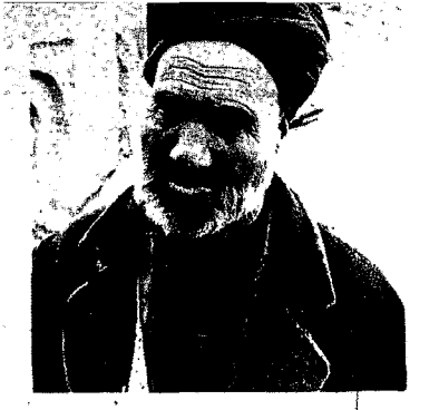
Above and below, villagers of rural Iran