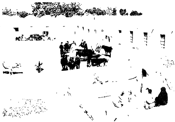
Iran has over 40,000 villages such as this. The houses form an enclosure which serves, among other things, as a pen for the cattle at night.

numerous small towns the population is composed of peasants, people living by agriculture. Some 10 years ago the number of villages was estimated at 40,000—each of them counting 300 persons as an average—and the number of settled rural families at 2.7 million. There are from two to three million nomads who live in tents and who, at the approach of the cold sea-